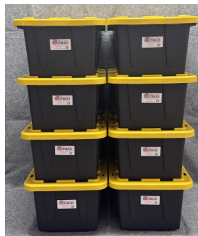
15 Gallon Heavy Duty Storage Totes

Four Tote Kit = $49. 95 plus tax Eight Tote Kit = $99 95 plus tax