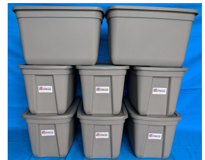
18 Gallon Storage Totes